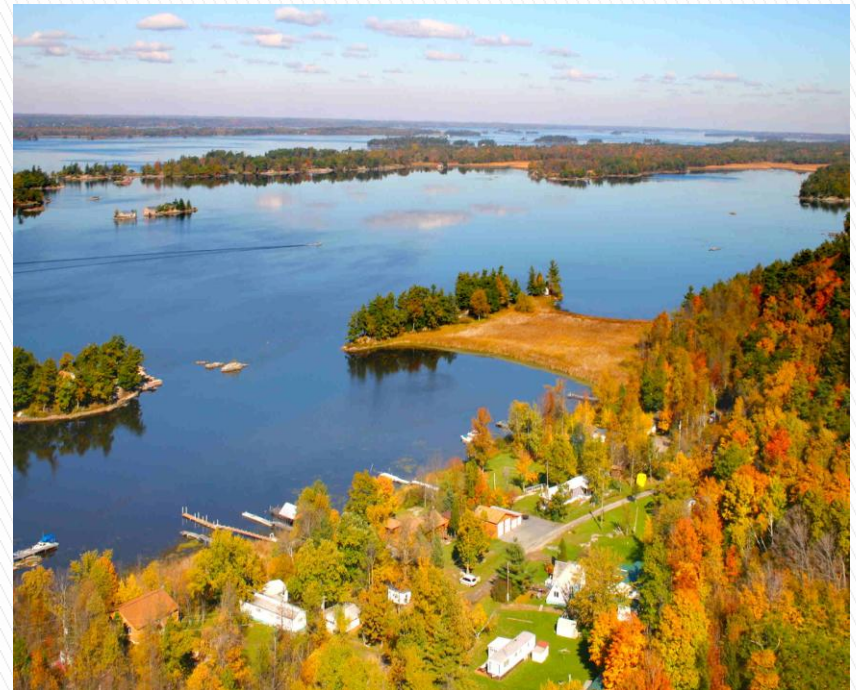
There (Fall of 2005)