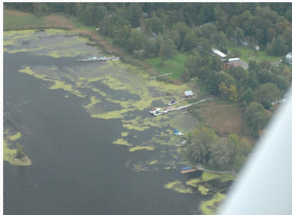
Here (Fall of 2013)